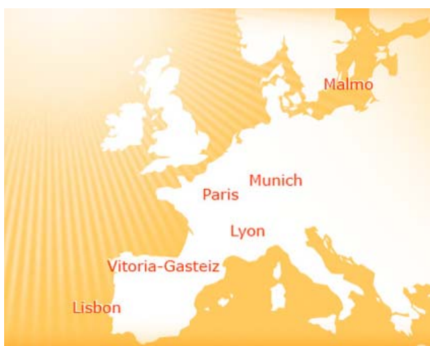
Figure 1. POLIS participating cities

The solar Action Plans have been developed using information about the existing local background in terms of energy supply, user behaviour, urban structures, building typologies, solar actions and measures, urban planning practices with solar requirements, etc. Each city